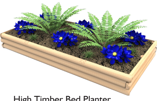
High Timber Bed Planter L 1800 W 450 H 585mm